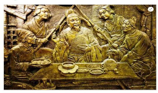
Plate 2: Literature of Momo Food (Vaidya, 2020)

In Nepal, Newar traders adapted the recipe, leading to innovations like "Momo-cha," smaller